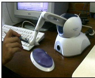
FIGURE. 1 HAPTIC DEVICE USED IN VR SYSTEMS.

Virtual reality systems for training can provide significant benefits over other methods of training, mainly in critical medical procedures. In some cases, those procedures are performed without any kind of visualization and the only information received is noticed by the touch sensations provided by a robotic device with force feedback. These devices can measure forces and torque applied during the user interaction [26] and these data can be used in an evaluation [5,24]. A specific kind of haptic device, as the presented in Figure 1, is based on a robotic arm and provides force feedback and tactile sensations during user manipulation of objects in a three dimensional scene. This way, user can feel objects texture, density, elasticity and consistency. Since the objects have physical properties, a user can identify them in a 3D scene (without see them) by the use of this kind of device [9]. This is especially interesting in medical applications to simulate proceedings in which visual information is not available. One of the main reasons for the use of such haptic devices in medical applications is their manipulation similarity when compared to real surgical tools.