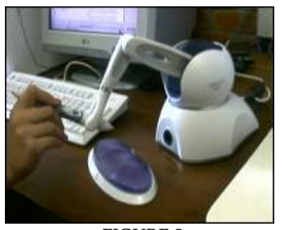
FIGURE 2 Haptic device Phantom Omni used in vr environments.

The assessment methods can be characterized as offline or online. Once the training ends, an online assessment can provide a quick feedback to the user. In an offline assessment the classification of training takes some time and depends on experts analyses of the training session. For didactic reasons, it is preferable the use of online evaluators, since users must have the classification of the training as soon as it is finished [10].