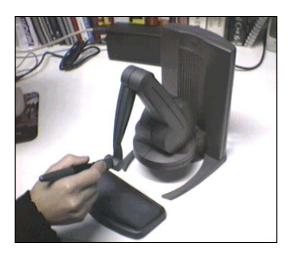
FIGURE, 1 THE PHANTOM DESKTOP IS A ROBOTIC DEVICE FOR FORCE FEEDBACK IN VIRTUAL REALITY SIMULATORS.

done without visualization for the physician, and the only information he receives is done by the touch sensations provided by a robotic device with force feedback. These devices can measure forces and torque applied during the user interaction [13] and these data can be used in an evaluation [4, 23]. An example of this kind of device is the Phantom Desktop presented in Figure 1.