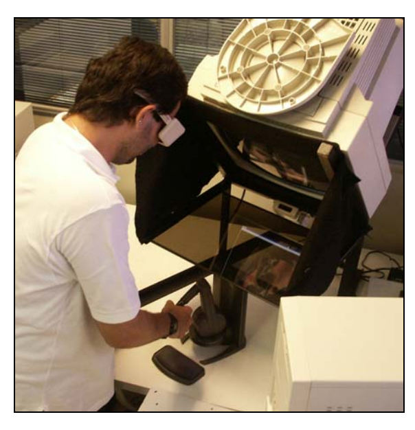
FIGURE. 3 THE VIRTUAL REALITY BASED SIMULATOR FOR BONE MARROW HARVEST TRAINING IN USE.

one of the stages of the bone marrow transplant. The procedure is done blindly, performed without any visual feedback, except the external view of the donor body, and the physician needs to feel the skin and bone layers trespassed by the needle to find the bone marrow and then start the material aspiration (Figure 2). The simulator uses a robotic arm (Phantom Desktop) that operates with six degrees of freedom movements and force feedback to give to the user the tactile sensations felt during the penetration of the patient's body as showed in the Figure 3 [15]. In the system the robotic arm simulates the needle used in the real procedure, and the virtual body visually represented has the tactile properties of the real tissues. The evaluation tool proposed should supervise the user movements during the puncture and should evaluate the training according to Mpossible classes of performance.